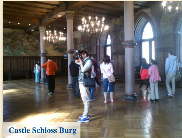
Castle Schloss Burg