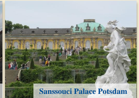
Sanssouci Palace Potsdam