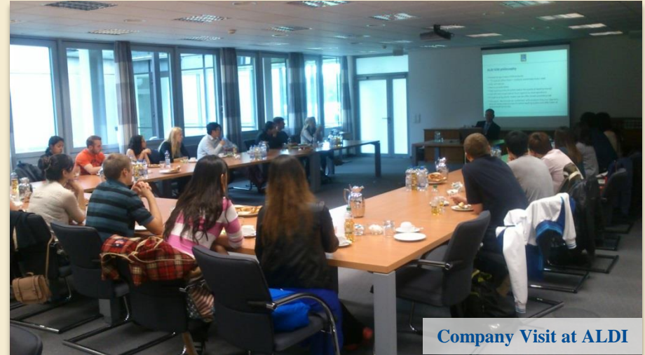
Company Visit at ALDI