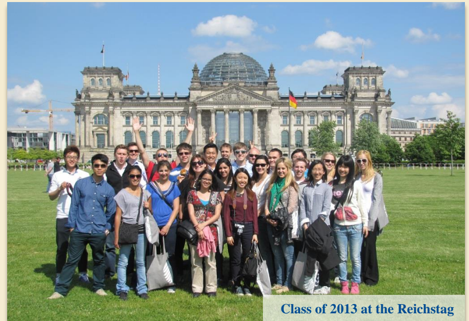
Class of 2013 at the Reichstag