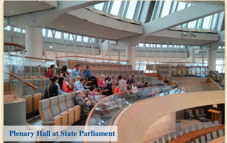
Plenary Hall at State Parliament