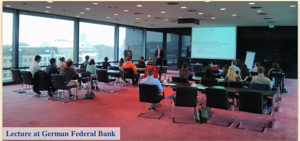
Lecture at German Federal Bank